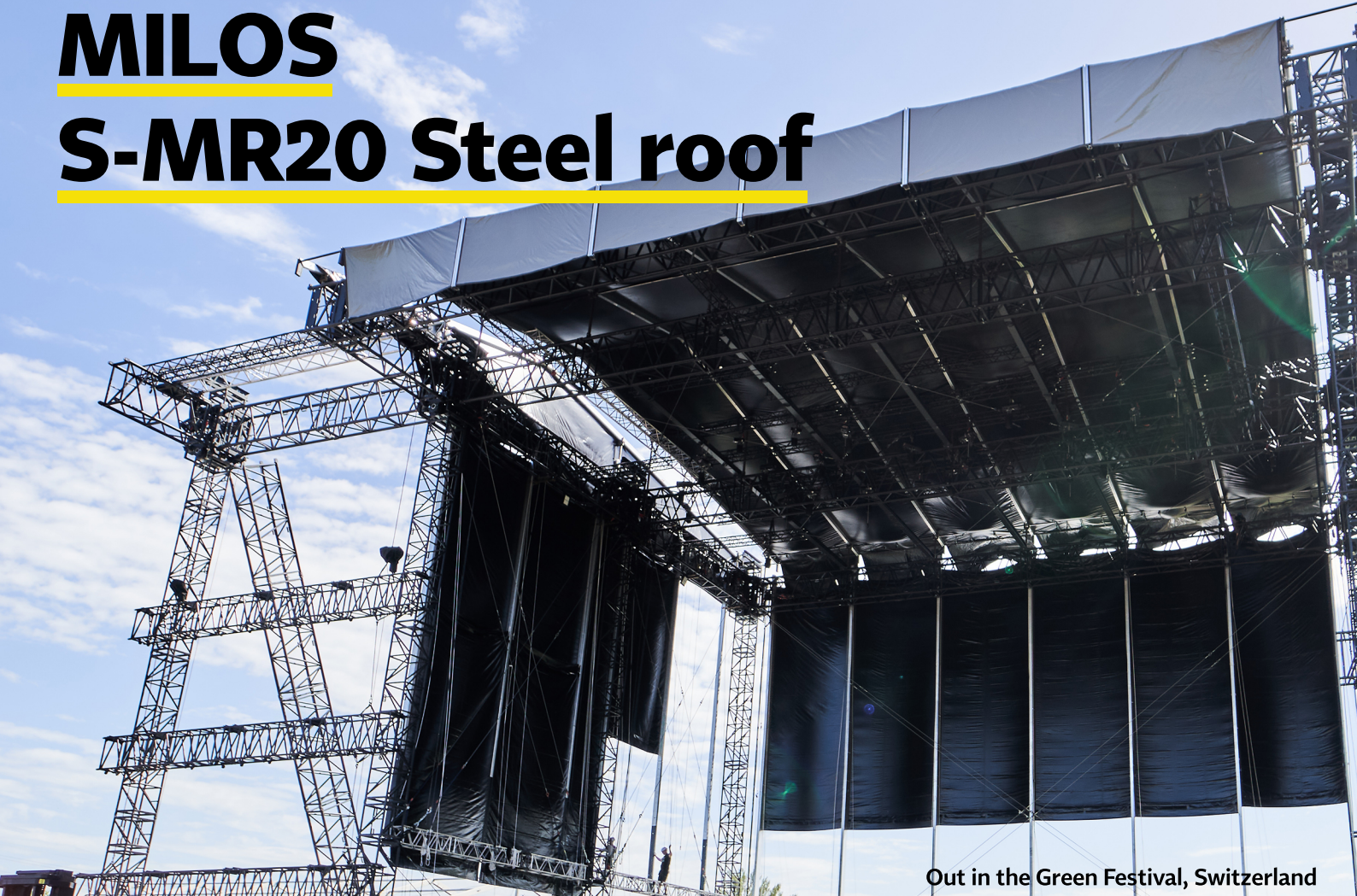
Out in the Green Festival, Switzerland