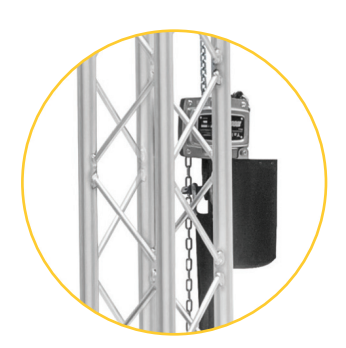
Handwinch or Manual Chain Block options available