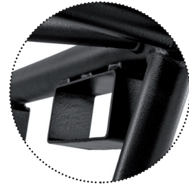
Forklift pick up points